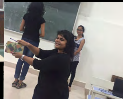
A Public Speaking workshop comprising of elocution, a street play and a video interview of a student on campus.