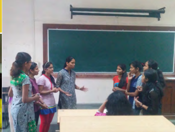
An activity based workshop conducted on English communication Skills.