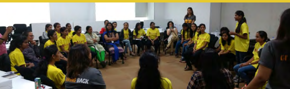
Katalysts interacting with women leaders at the Symantec Global Service Week 2016.