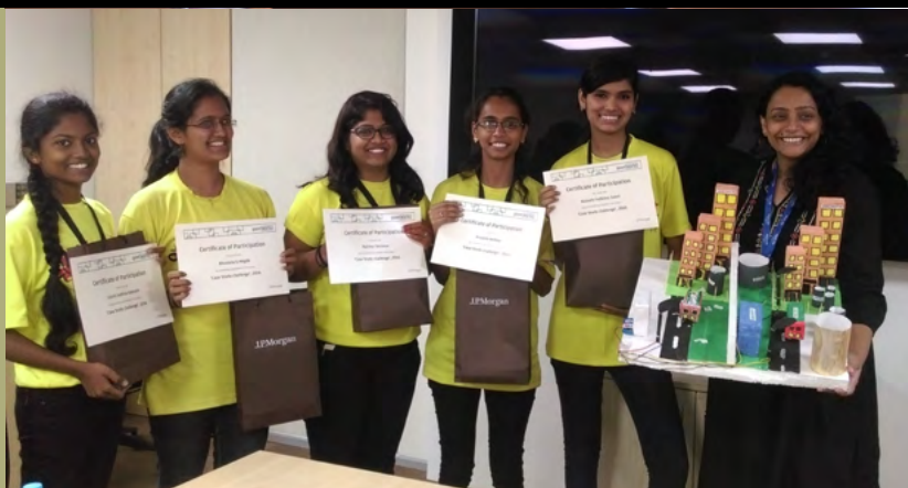
Katalyst together with JP Morgan organised a Case Study Presentation in Mumbai and Bangalore. Each team was assigned a mentor. Seen here are the winners who presented on a Waste Management System.