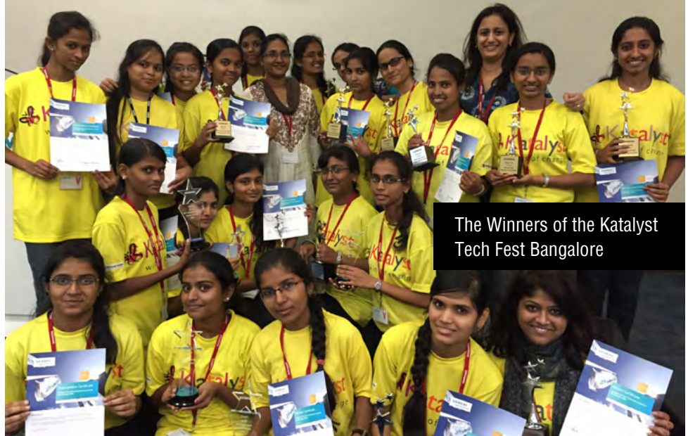
The Winners of the Katalyst Tech Fest Bangalore