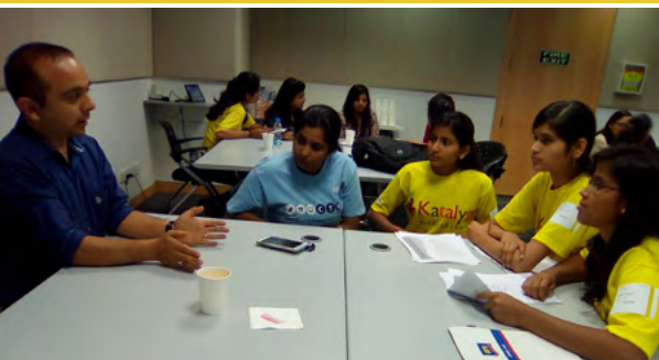
Five day Interview skills training on algorithms conducted by Goldman Sachs, Bangalore.