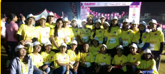
Katalysts participated in the Pune Pinkathon

128 Shiny-Happy Katalysts have been inducted in the Bangalore and Pune centres.