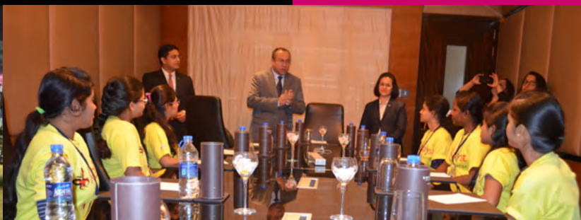
Training on interview and grooming etiquettes and Zumba workshop by Sofitel, Mumbai